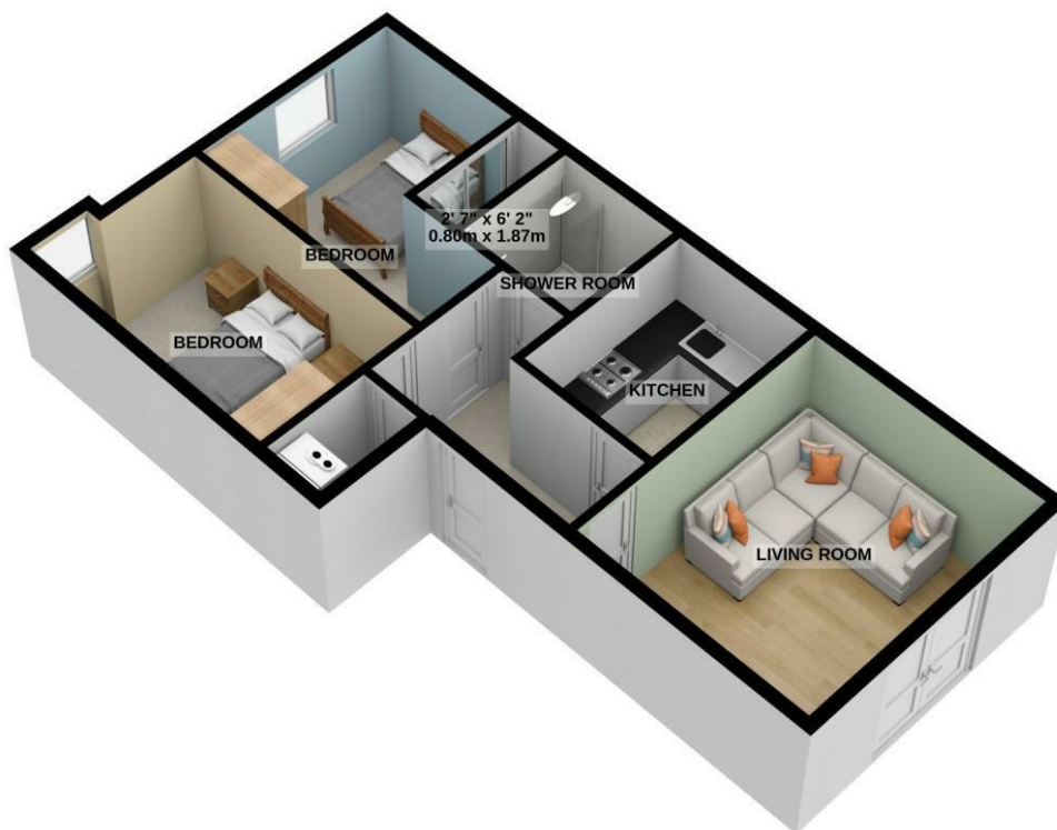
4/8 WEAVERS LINN, GALASHIELS. TD1 3SX.